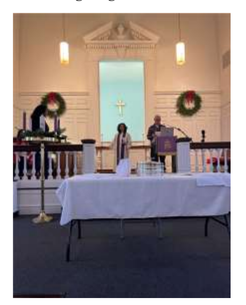
First Sunday of Advent