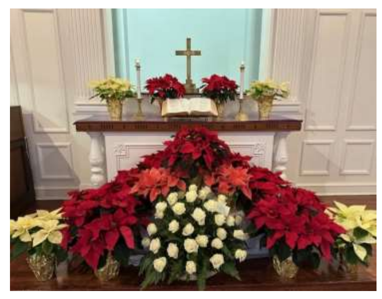
Advent Candle Lighting